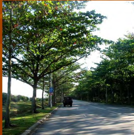
Terminalia catappa - 香港園藝專業學會