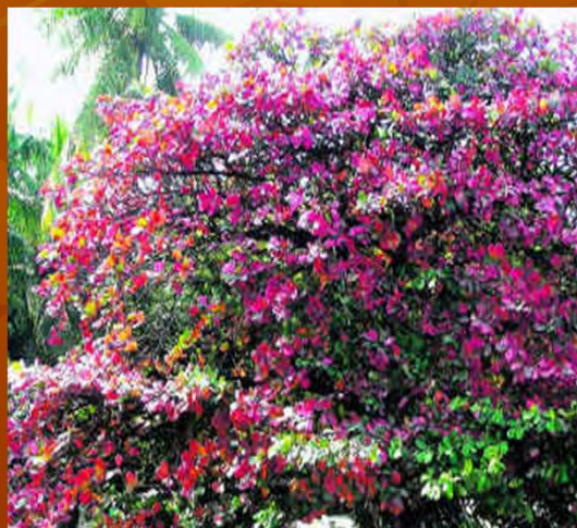
Terminata Catappa (Indian Almond)-香港園藝專業學會