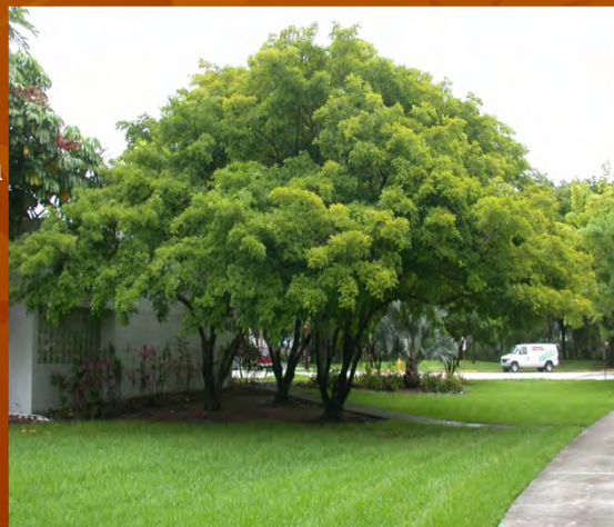
Pongamia pinnata 香港園藝專業學會